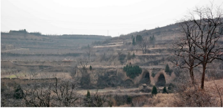
Figure 3. Former site of Yang Lingjun's terraces in Gounan village, which Baishui County's local leaders extolled as a model for water and soil conservation during the 1950s.

tablelands and plateaus (figure 3). 22 Yang had dug more than four hundred water cellars in his lifetime, and though he could not engage in physical labor in the 1950s due to his old age, he personally went down into the water cellars to direct younger workers. 23