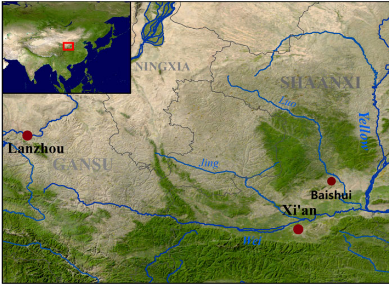
Figure 1. Map showing location of Baishui County. Credit: Map drawn by Rao Su.

hamper agricultural production and contribute to Baishui's relative poverty (figure 1). 7 A 1953 survey investigation conducted by the PRC's Yellow River Conservancy Commission noted that outside of Guangzhong, in the hill-gully and plateau-gully areas of the Luo River's upper and middle reaches, "irrational utilization by humans" had deteriorated soil structures, which in turn weakened drought resistance and water-retention capacity. 8 Because the land was not "rationally utilized," the destruction of vegetation intensified erosion, which, as the report stated, influenced "social development and peasants' livelihoods." 9